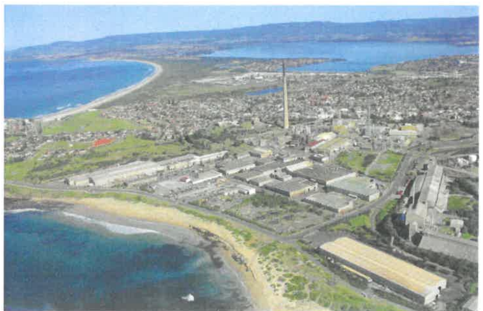
MM Kembla's Australian manufacturing facilities at Port Kembla.

MM Kembla manufacturing processes and quality systems are built upon 100 years of experience in manufacturing copper tube. An intensive ISO9001 certified quality control system is applied to all MM Kembla products. MM Kembla also has a variety of third party accreditations to Australian, New Zealand, British/ European and American standards.